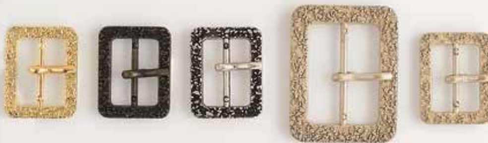
Art. F3208M/20 /30