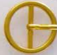
Art. FIB1313M/20 /30 /40