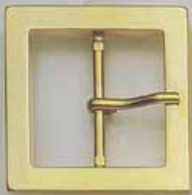
Art. F 224M/30 /25 /20 /15 /10