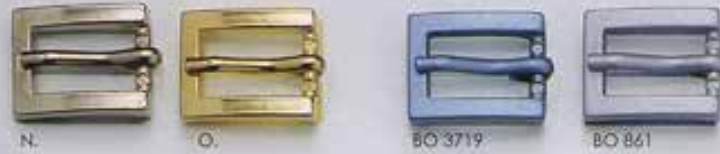
N. O. BO 3719 BO 861