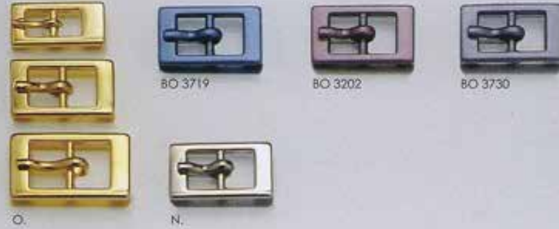
BO 3719 BO 3202 BO 3730