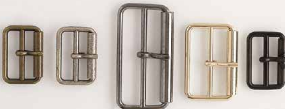
Art. F3239M/25 /35 /50