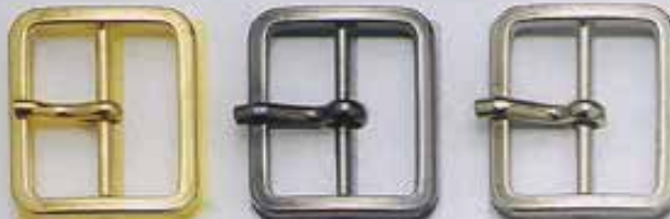
O. C.F. N.