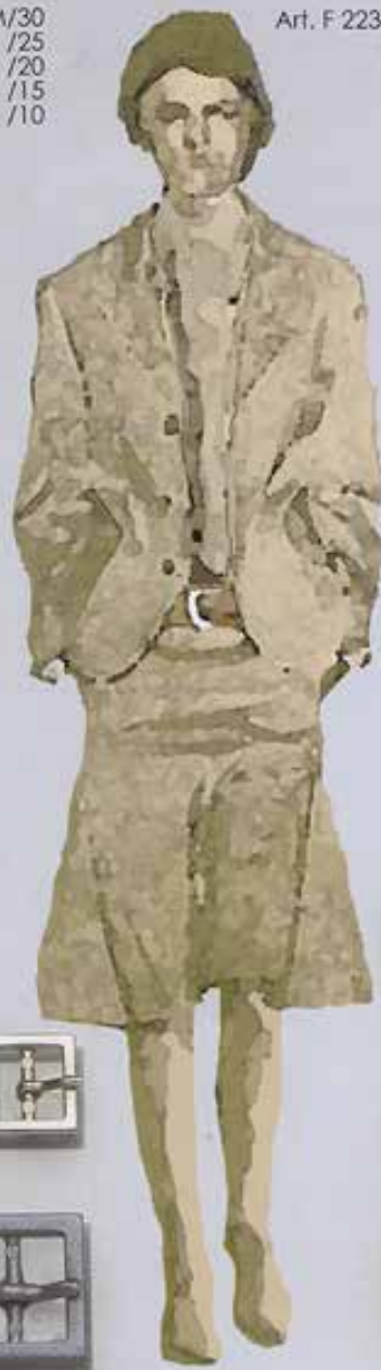
Art. F 223M/30 /25 /20 /15 /10