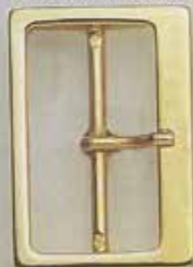
Art. F 225M/40, /30, /25