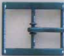
colore di tendenza trendy colour