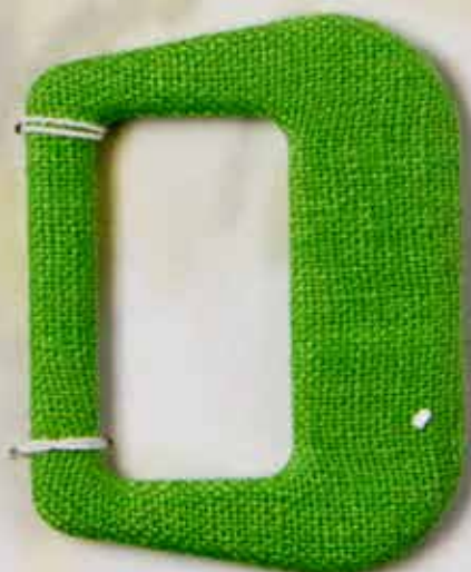
Mod. SYDNEY HS 4.0 cm