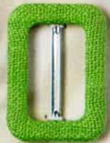
Mod. LOIRE 2.5 cm