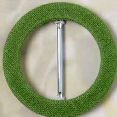
Mod. TIGRIS 4.0 cm