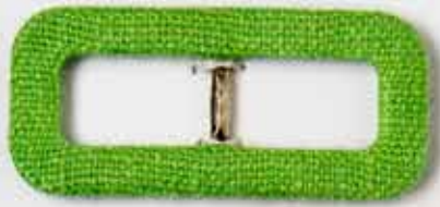
Mod. MOSEL 1.0 cm