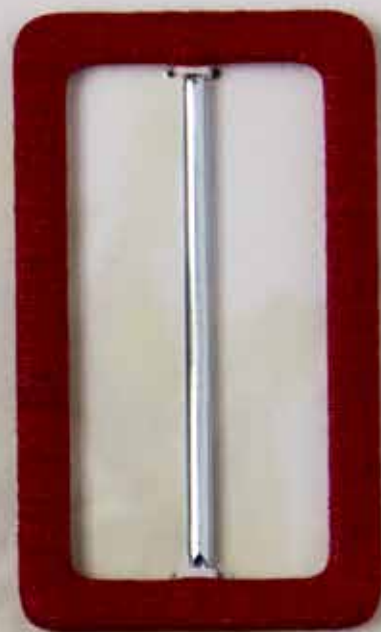
Mod. HUDSON 6.0 cm