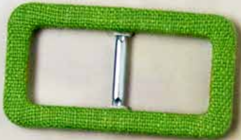
Mod. DONAU 2.0 cm