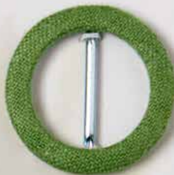
Mod. WESER 3.0 cm