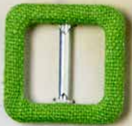
Mod. ISAR 2.0 cm