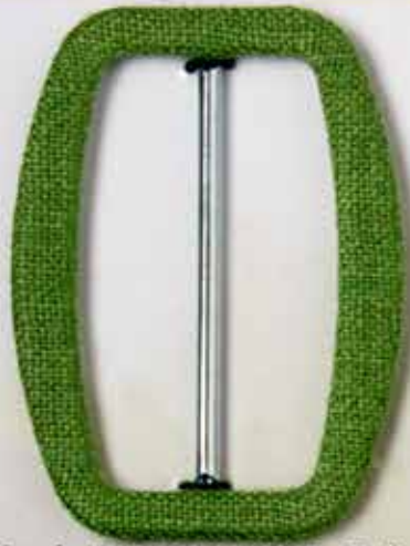
Mod. THEMSE 5.0 cm