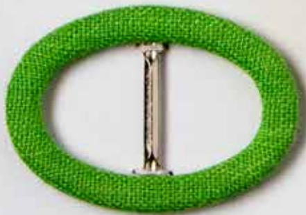
Mod. MARNE 2.5cm