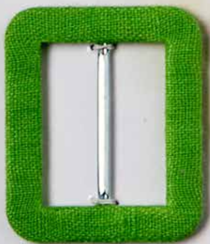
Mod. BERLIN 4.0 cm