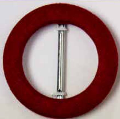
Mod. JADE 3.0 cm