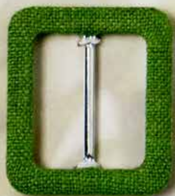
Mod. TIBER 3.0 cm