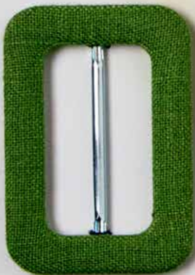
Mod. COLORADO 5.0 cm