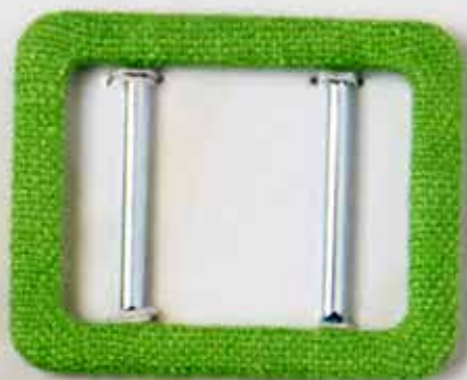
Mod. NIL 2F 3.0 cm