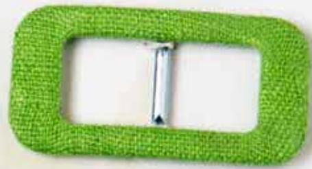
Mod. MILANO 1.5 cm