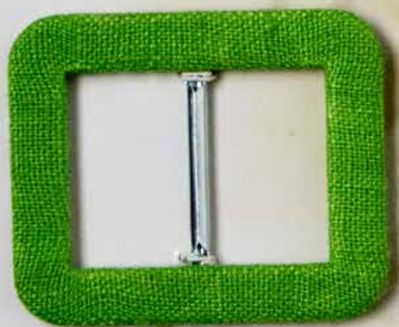
Mod. BERLIN 3.0 cm