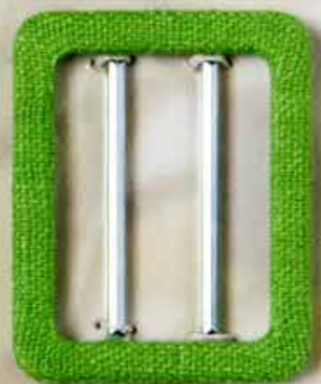
Mod. NIL 2F 4.0 cm