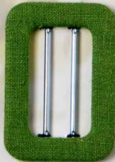
Mod. COLORADO 2F 5.0 cm