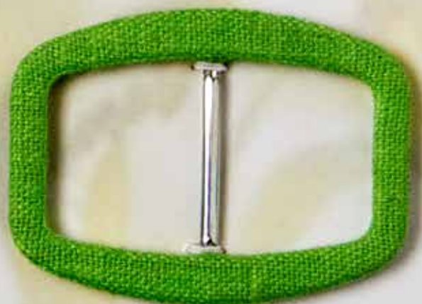
Mod. THEMSE 3.0 cm