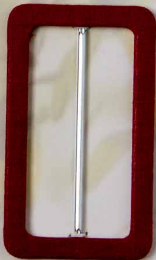
Mod. NECKAR 8.0 cm