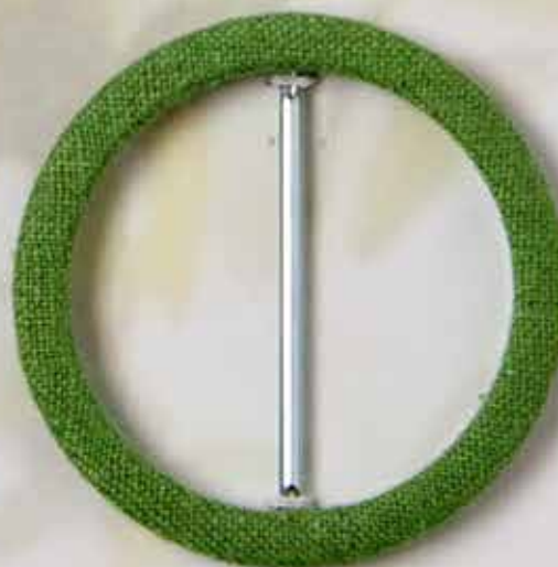
Mod. HAVEL 5.0 cm