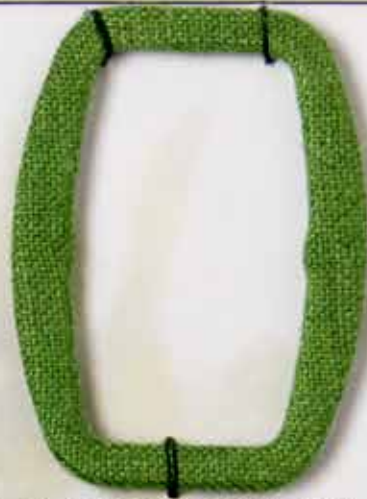
Mod. THEMSE HS 5.0 cm