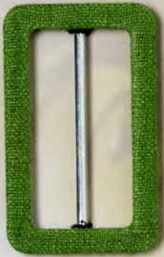
Mod. RHONE 5.0 cm