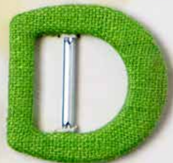
Mod. SAAR 2.5 cm