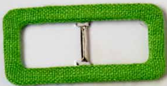
Mod. WIEN 1.5 cm