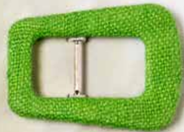
Mod. RIO 1.5 cm