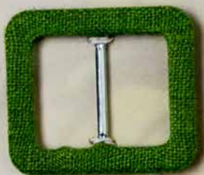
Mod. TIBER 2.5 cm