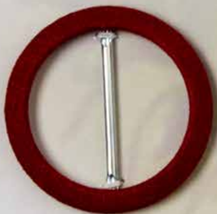
Mod. FULDA 4.0 cm