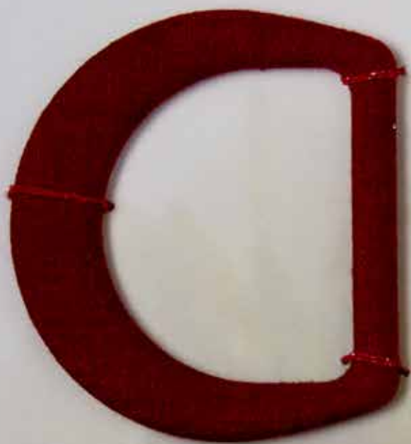
Mod. NEW YORK HS 5.0 cm