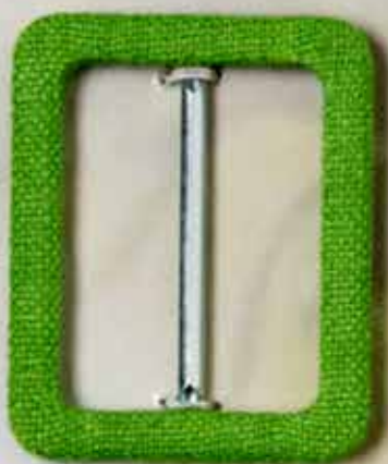
Mod. NIL 4.0 cm