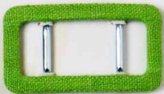
Mod. DONAU 2F 2.0 cm