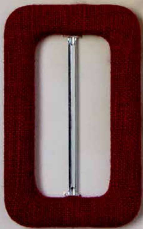
Mod. GARONNE 6.0 cm