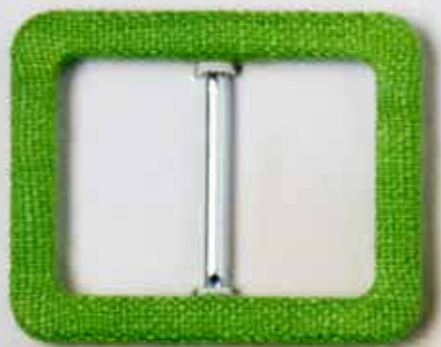
Mod. NIL 3.0 cm