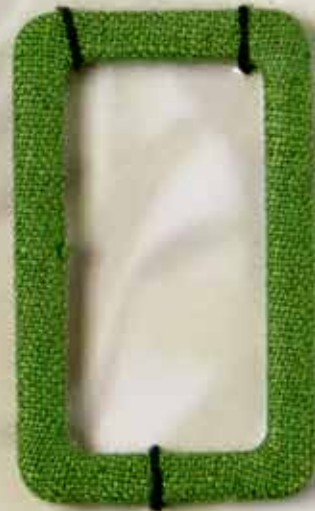
Mod. RHONE HS 5.0 cm